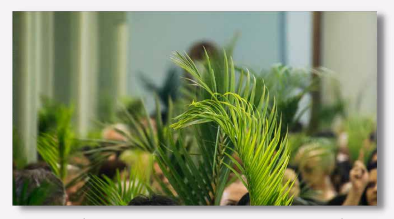
Sun., April 2, 2023 | Palm Sunday Mass (Holy Week begins) 11 a.m. (Chapel of the Incarnate Word) & 7 p.m. (Our Lady's Chapel)

For details and a complete listing of all our events, please see our <u>UMM Events Calendar</u>