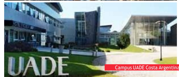
Campus UADE Costa Argentina

Address: Lima 775 (C1073AAO) City: Ciudad Autónoma de Buenos Aires Zip Code: C1073AAO Phone: +54-11- 4000-7600 Web site: www.uade.edu.ar