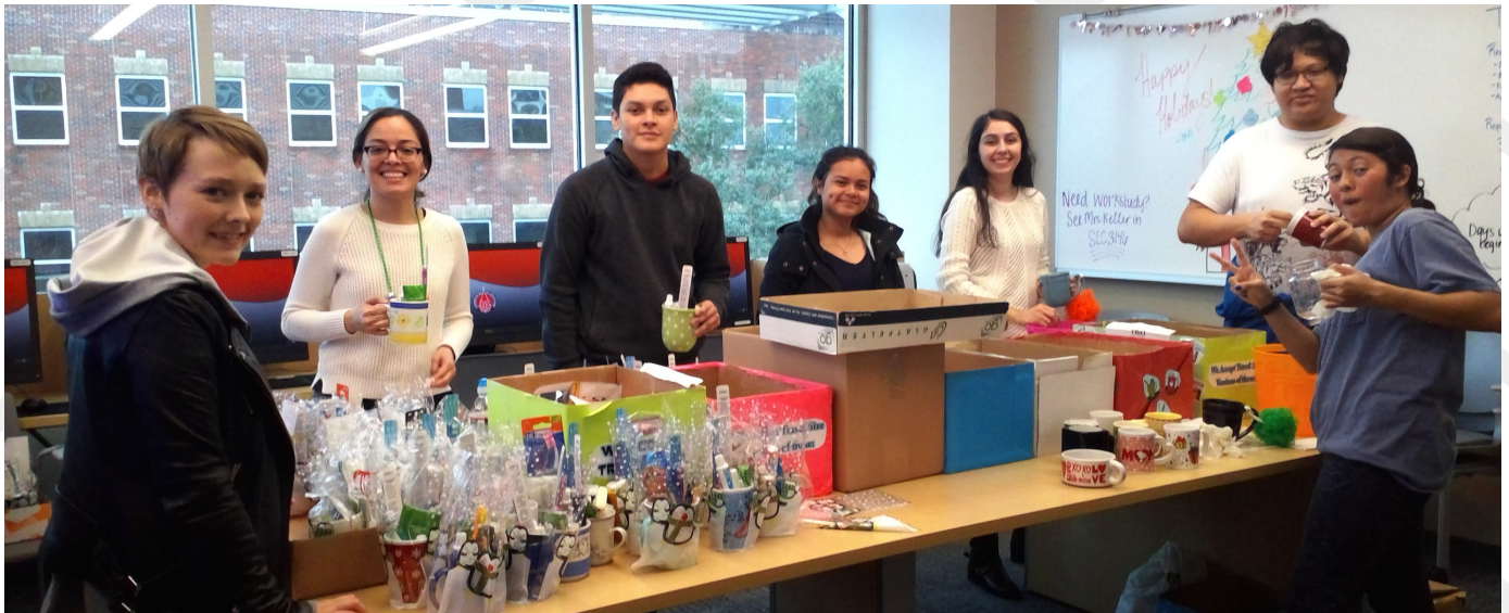
Volunteers at Cup Runneth Over 2017