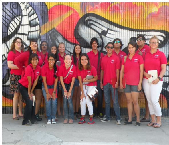
CCL members pose in front of a mural on the east side of town.

Five sophomore TRiO students were inaugurated in the first Cardinal Community Leaders program sponsored by the new Center for Civic Leadership.