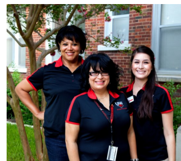
TRiO SSS Staff